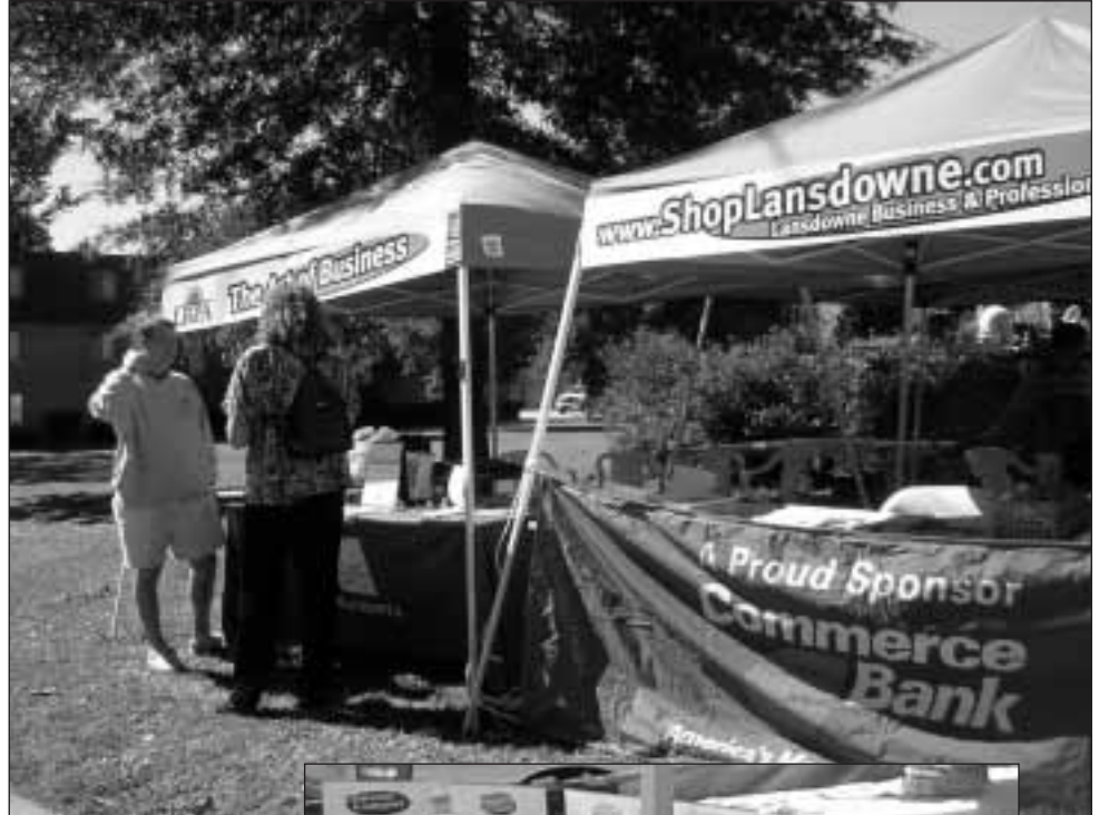
Member information and fliers were available for visitors to the LBPA pavilion.